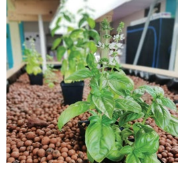
TOP: PLANTING DAY AT LA ACADEMIA. BOTTOM: INDOOR GARDEN TRANSPLANTING AND AQUAPONIC GROWING SYSTEM AT INTEGRATED ARTS ACADEMY.